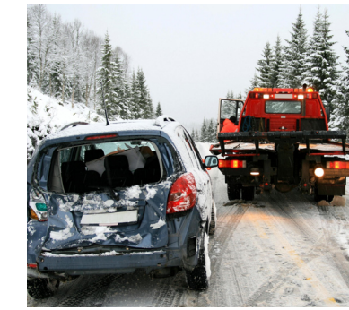
TCS Wireless E9-1-1

baseband, and wireless communications capabilities to transport encrypted voice, video, and data.