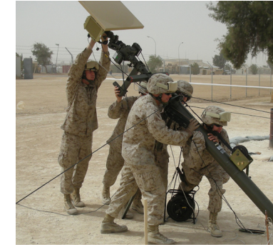
Wireless Point-to-Point Link

emergency communications, and we are working closely with the industry organizations that are shaping the emerging NG9-1-1 standards.